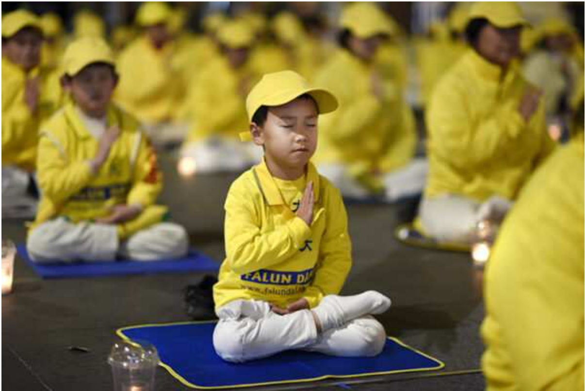
Falun Dafa practitioners commemorate lives lost and 20 years of persecution by the Chinese communist regime in Sydney, Australia, on July 19, 2019.