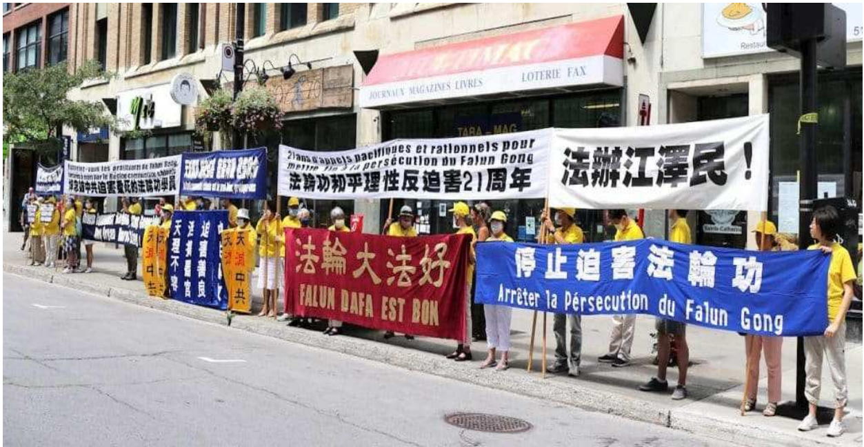
Montreal, Canada Rally in front of the Chinese Consulate in Montreal on July 16, 2020