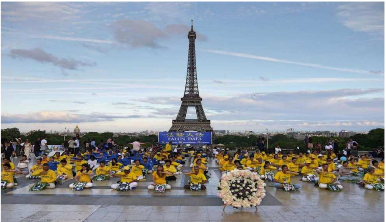
Paris, France Candle vigil for Falun Gong practitioners who lost their lives in the ongoing persecution (2019)