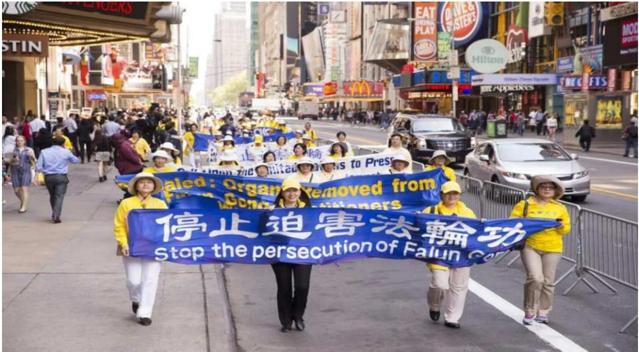
New York, United States Falun Gong practitioners parade through New York, United States to raise awareness of the ongoing persecution (2015)