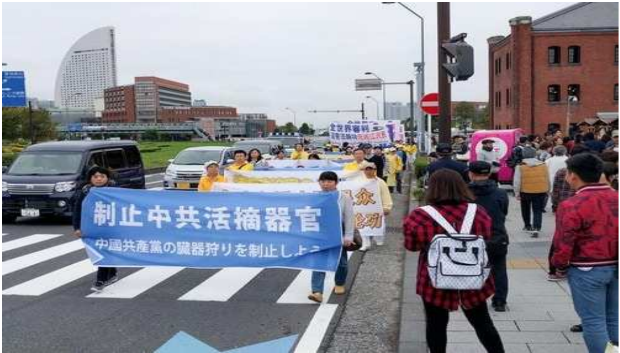
Yokohama, Japan Falun Gong practitioners parade through Yokohama, Japan (2017)