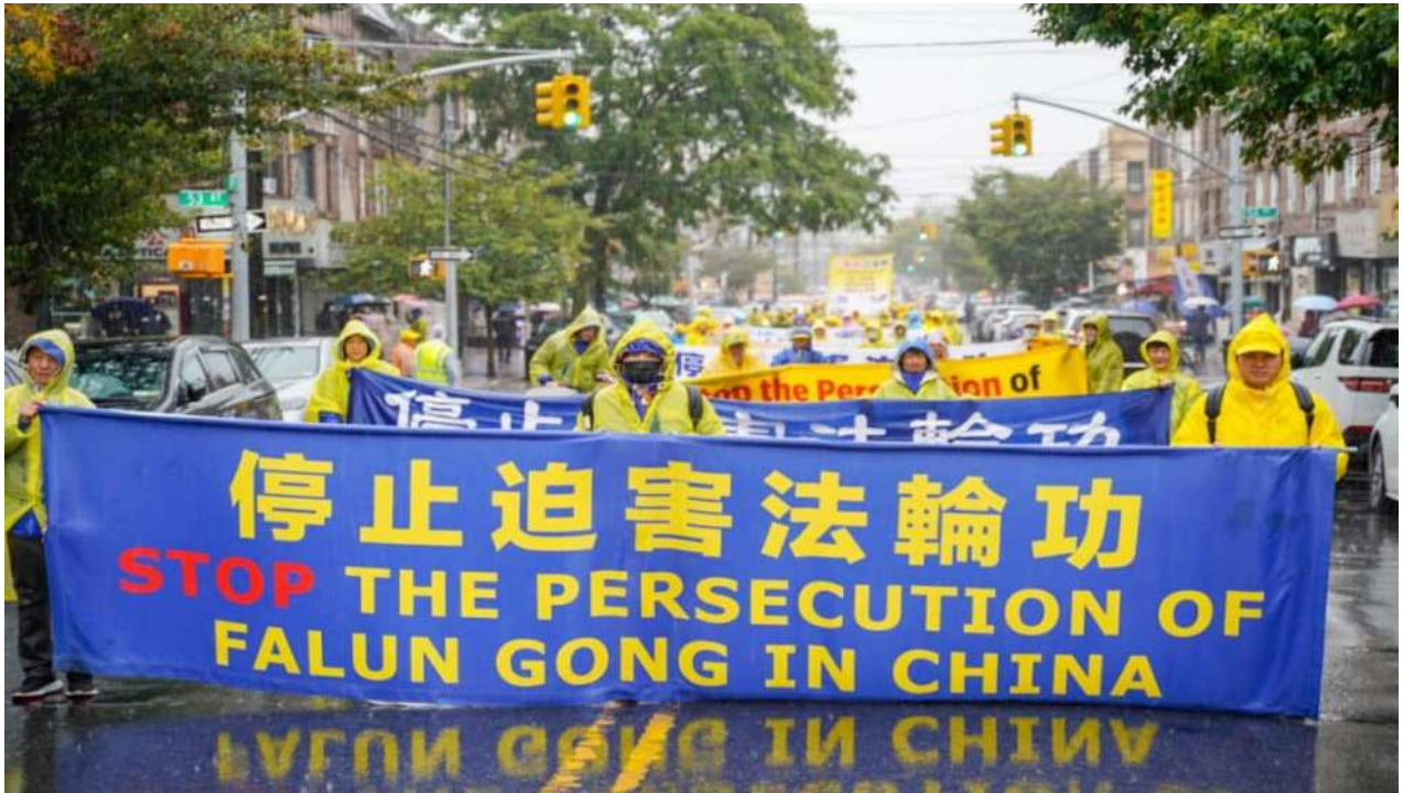
New York, United States Falun Gong practitioners parade through Brooklyn, New York (2022)