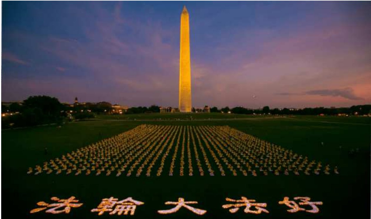
Washington D.C., United States Falun Gong practitioners hold candle vigil on July 20, the anniversary of the onset of the persecution (2020)