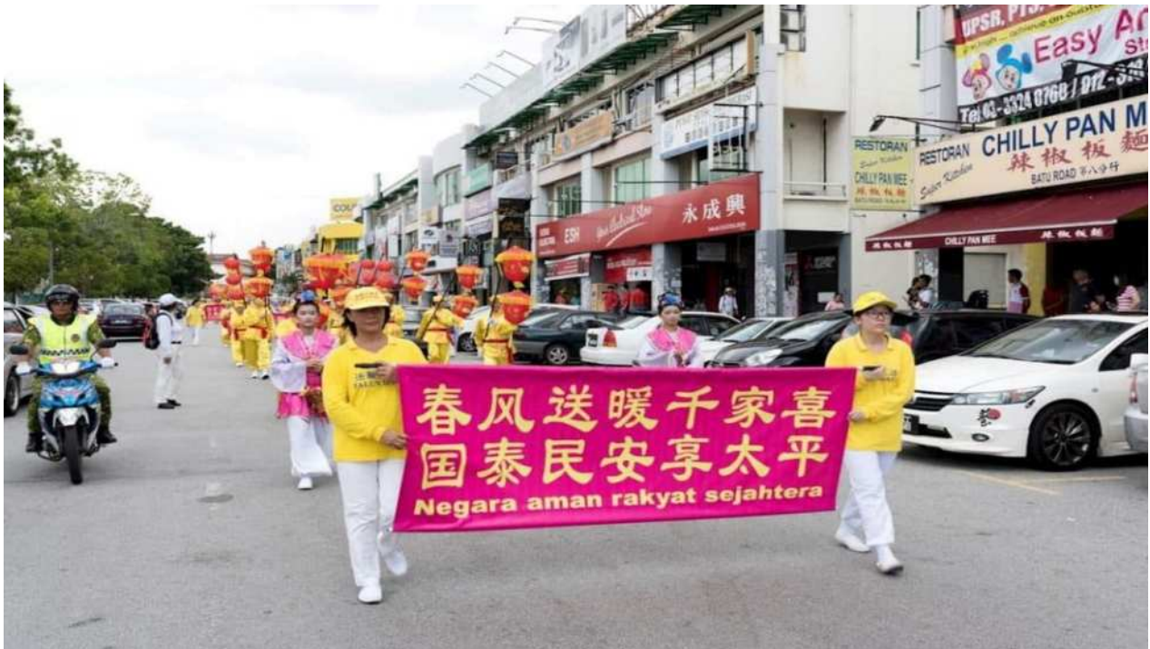
Selangor, Malaysia Falun Gong practitioners parade through Malaysia (2016)