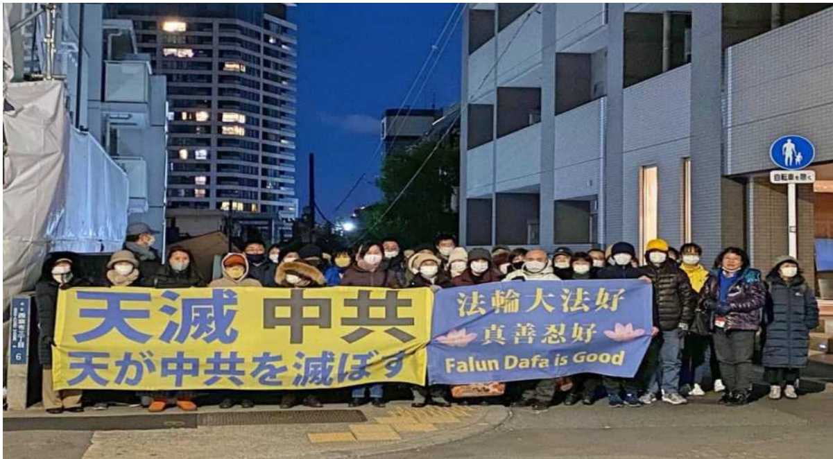
Kanto, Japan Falun Gong practitioners protesting in front of the Chinese Consulate in Kanto, Japan on December 31, 2020