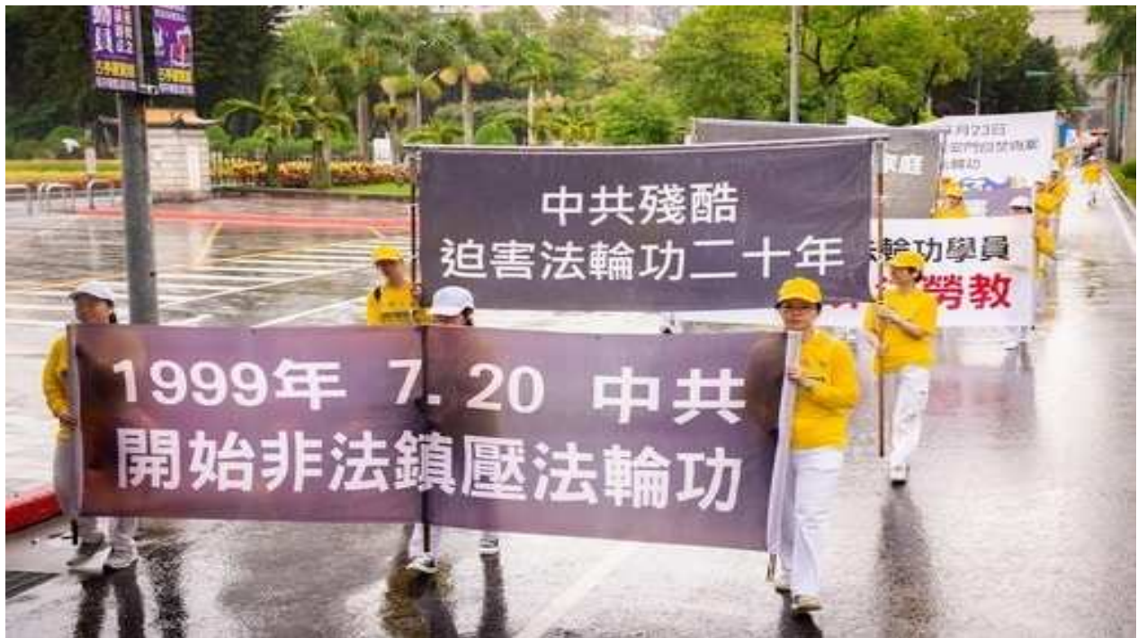
Taipei, Taiwan Falun Gong practitioners participate in parade in Taiwan (2019)