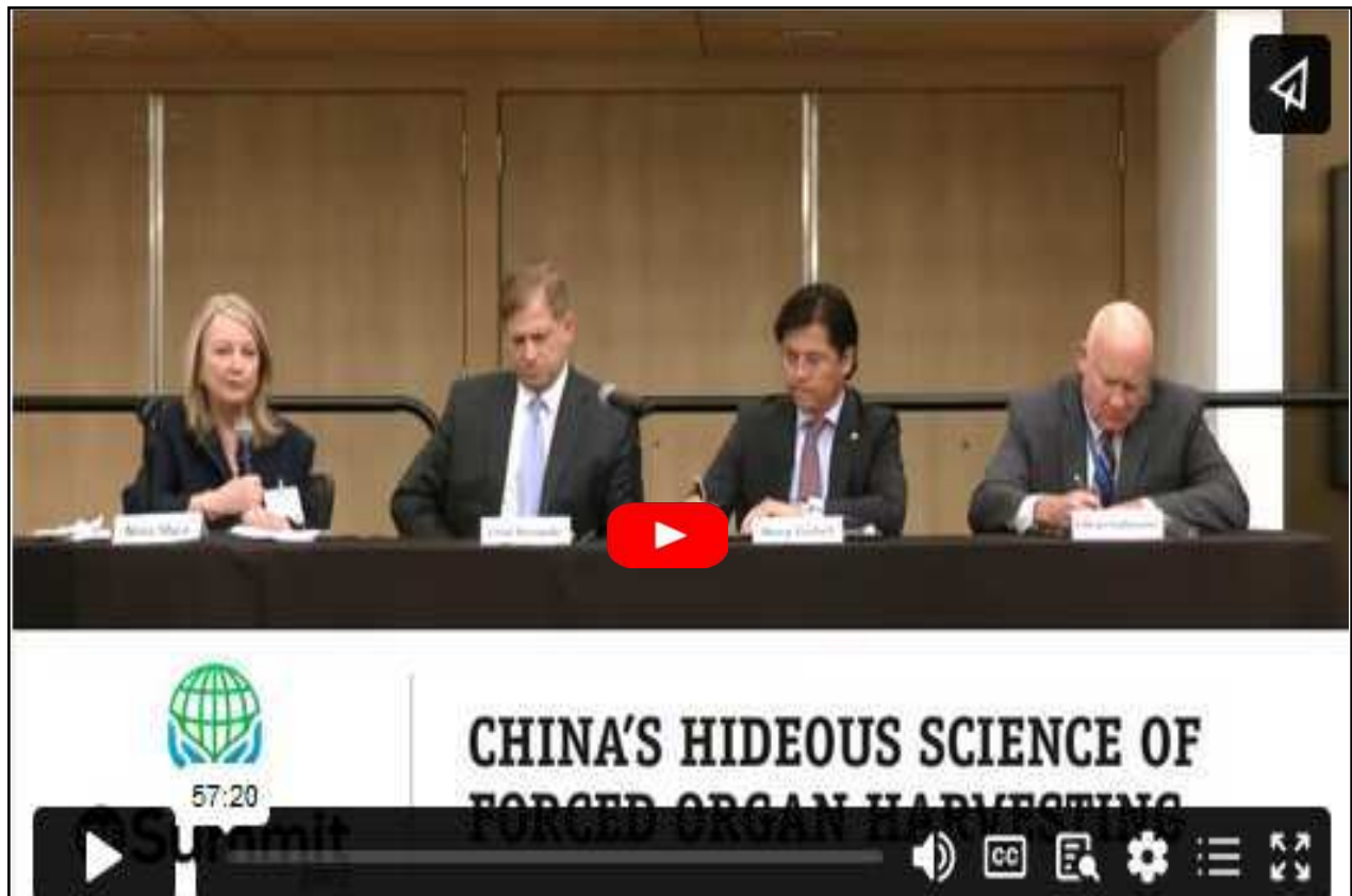
2022 International Religious Freedom Summit Panel

The most recent panel held in Washington, D.C., was at the International Religious Freedom Summit in June 2022.