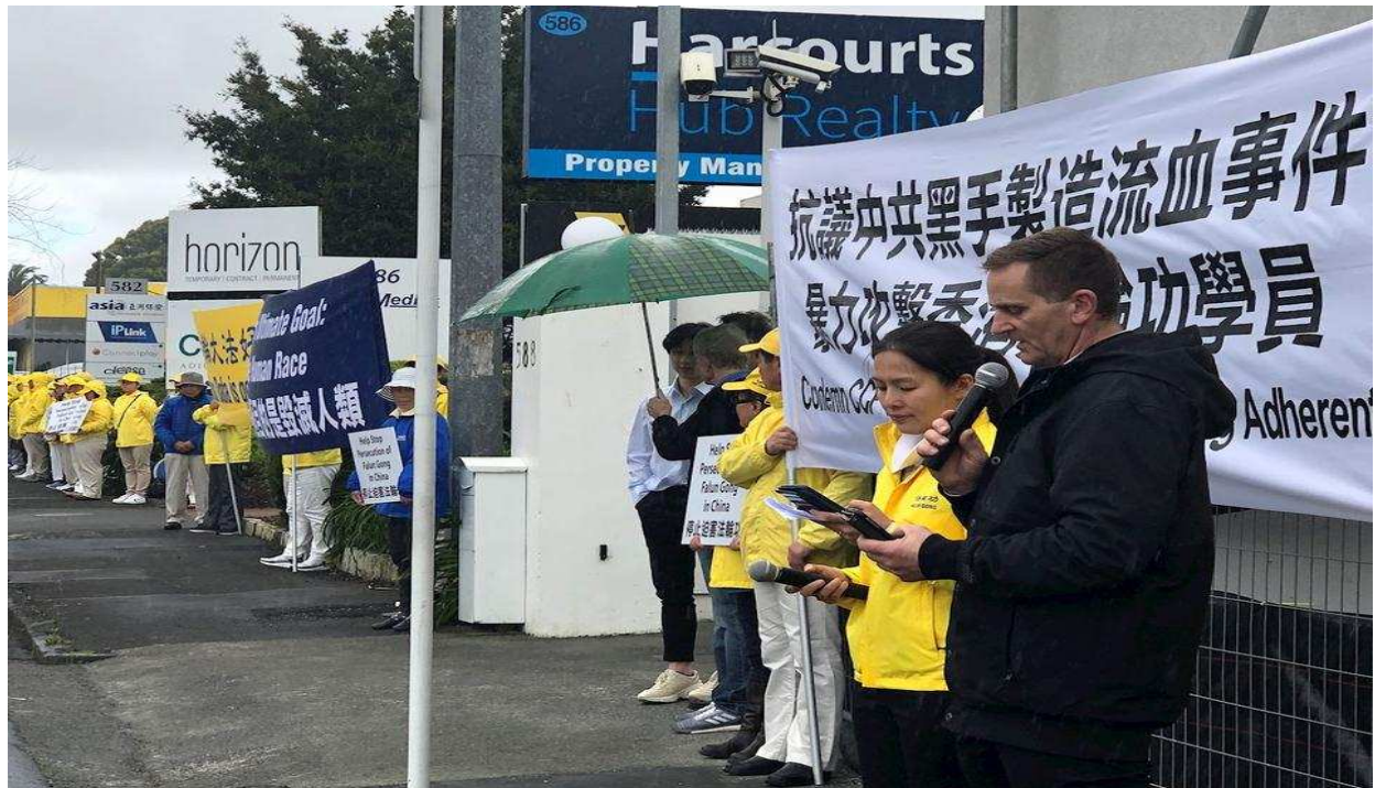
Auckland, New Zealand Rally outside the Chinese Consulate in Auckland, New Zealand in 2019