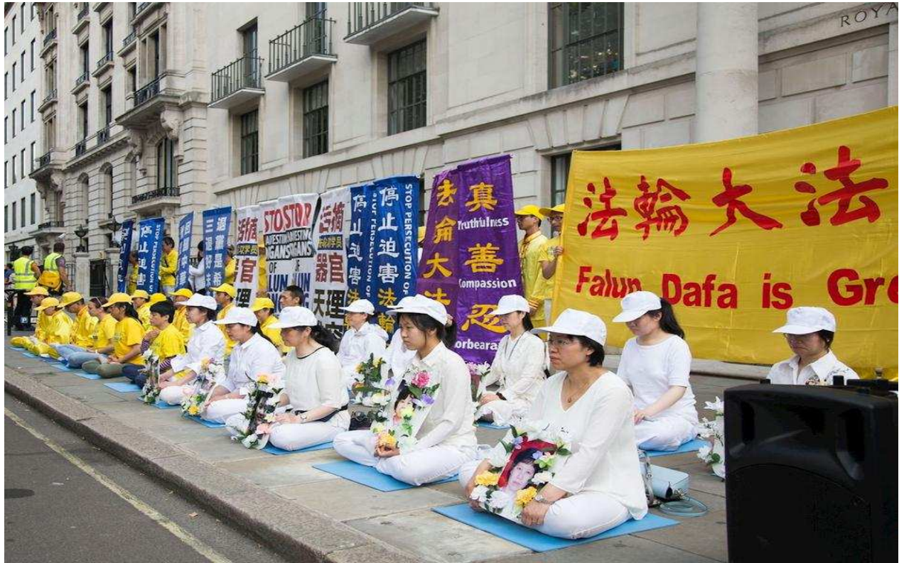
London, England Falun Gong practitioners staged a peaceful protest in front of the Chinese Embassy in London on July 21, 2018