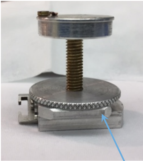
The base is flipped upside down